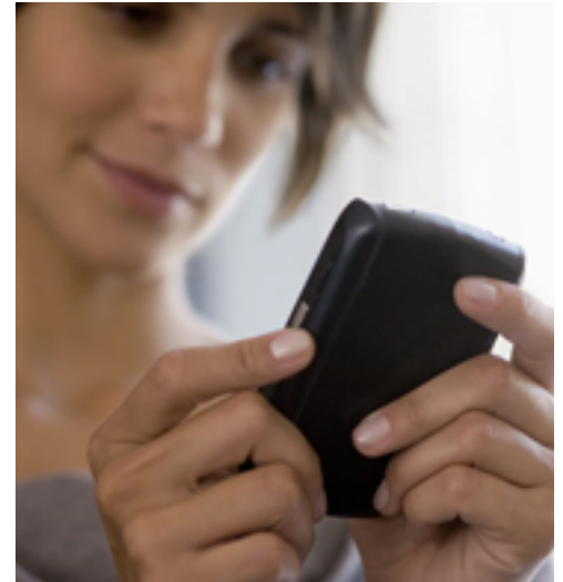
Follow these guidelines to stay pain-free.

Stretching, limiting your smartphone use, and receiving frequent massage are all successful ways to alleviate the strain caused by repetitive use. Listen to your body, and communicate with your massage therapist about any pain or discomfort that might arise from the use of these devices.