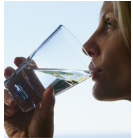
Stay hydrated to keep energy up.