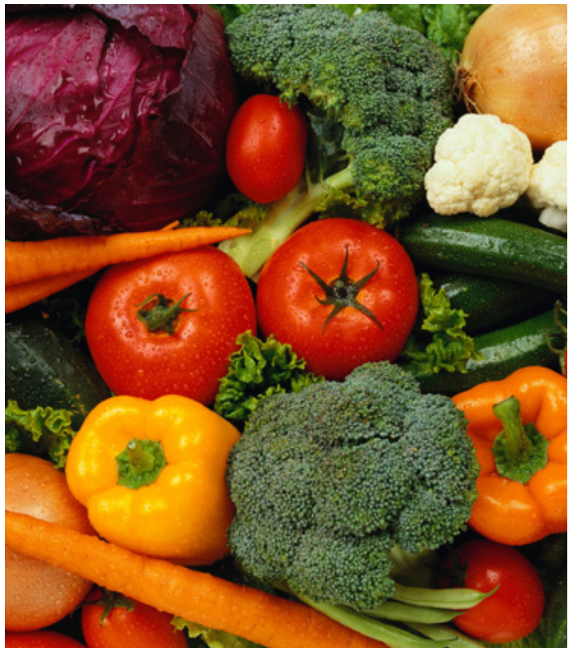
A colorful diet can help provide sun protection from the inside out.

With a few protective measures, you can continue to enjoy fun in the sun safely. Wear your sunscreen--in the winter months as well as the summer--seek shade, cover up with sleeves and pants, and don't forget your hat!